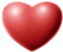
3 rd Grade CCA Upper ES

Students in 4 th and 5 th grade have minimal growth however; most scores are close to bench mark (50%)